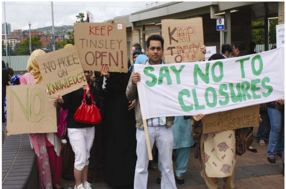
Tinsley students join protest at Castle College

This is a big blow for Tinsley residents on ESOL Courses (learning English). Not only will they have to travel to town for courses, but the Government has changed the eligibility of people paying reduced fees. The courses cost between £600 and £800 per student. This will put learning English as a Second Language out of reach of most people in the area.