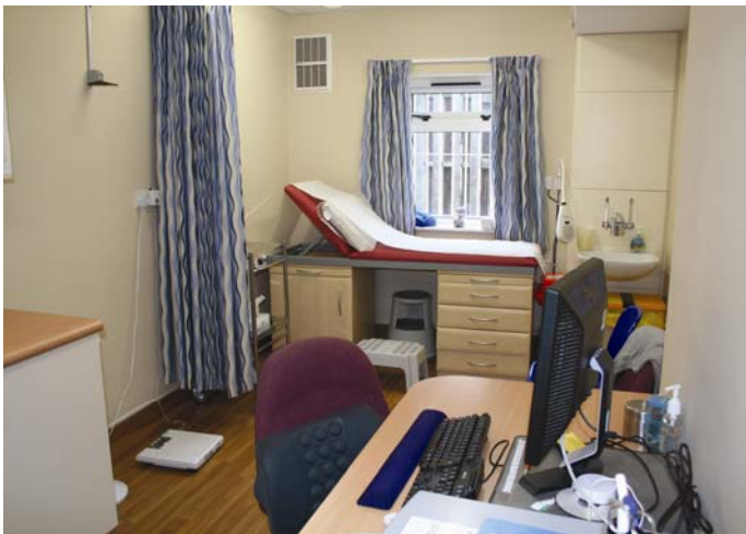
A new consulting room at Highgate Surgery